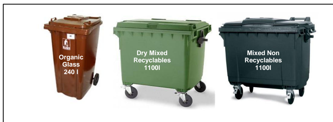
Figure 5.1 Typical waste receptacles of varying size (240L and 1100L)

The types of bins used will vary in size, design and colour dependent on the appointed waste contractor. However, examples of typical receptacles to be provided in the WSA are shown in Figure 5.1. All waste receptacles used will comply with the IS EN 840 2012 standard for performance requirements of mobile waste containers, where appropriate.