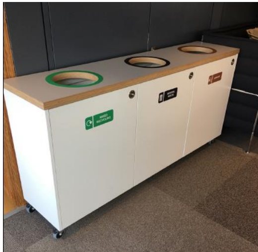
Figure 5.2 An Indicative Area Waste Station (AWS) unit

An option for the types of bins that could be provided are illustrated in Figure 5.2 below.